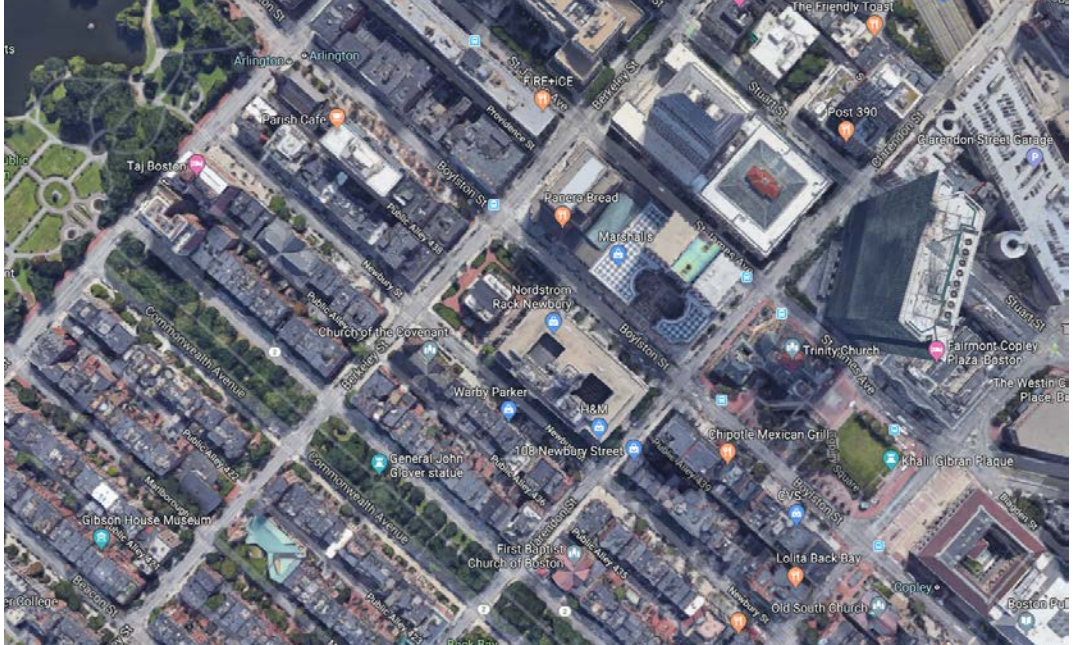
Figure 2 Aerial of Boylston Street

such as post and ring style bicycle racks. Figure 2 below shows an aerial image of Boylston Street.