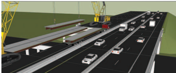
The Fast 14 project will replace bridge decks on the northbound and southbound sides of Interstate 93 with new modular deck panels, as shown in this MassDOT graphic.

The Fast 14 project is being conducted under MassDOT's Accelerated Bridge Program. The Boston Region MPO approved spending $70 million in federal funds on this project through the federal fiscal years 2011–14 Transportation Improvement Program.