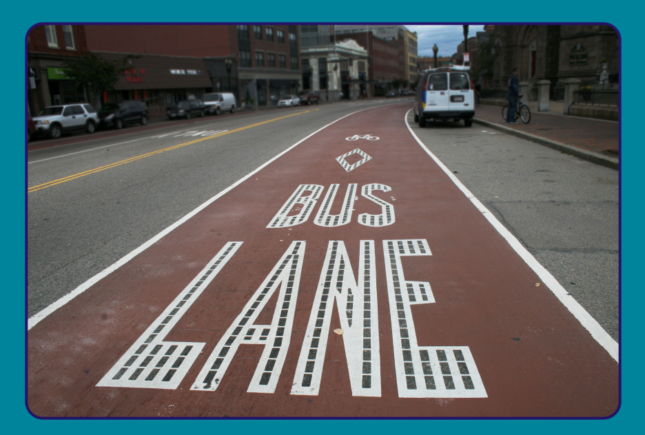
Prioritization of Dedicated Bus Lanes bostonmpo.org/prioritization-of-dedicated-bus-lanes