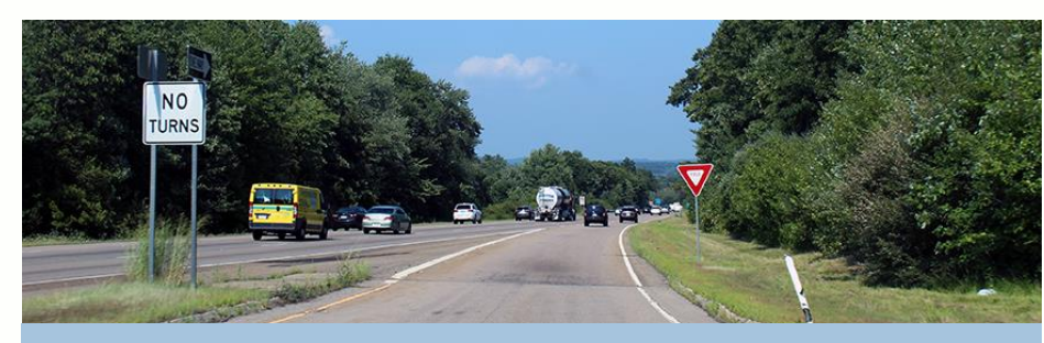
Principal Arterial Freeways or Expressway