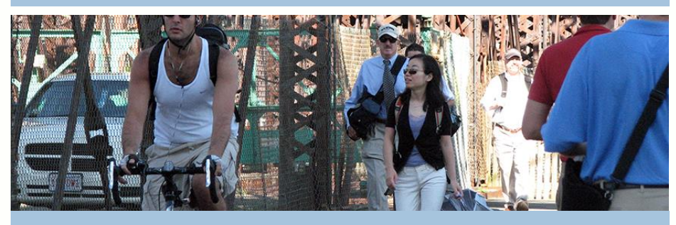
Bicycle Network and Pedestrian Connections