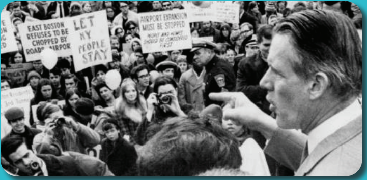
On November 30, 1970, not long after becoming Governor of Massachusetts, Francis Sargent declared a moratorium on highway building inside the Route 128 loop and called for a comprehensive multimodal study of the region's transportation needs.

In combination with the nation's environmental movement, and the passage of the federal Clean Air Act, establishment of other air quality regulations, and the creation of the EPA, these advocacy efforts attracted significant political support to the highway revolts.