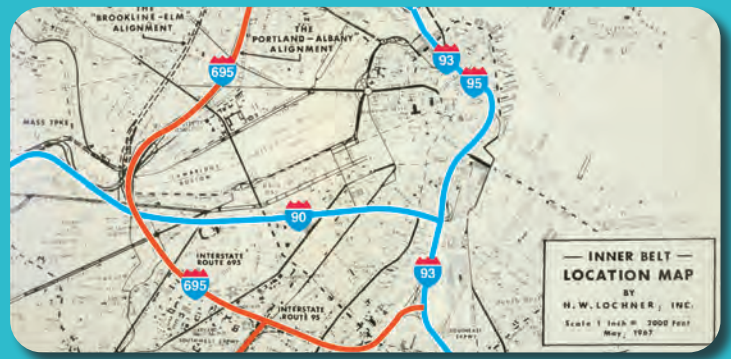
Projects, such as the Inner Belt in Massachusetts, would have displaced thousands of people.