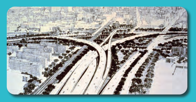
MPOs were in a large part a reaction to the 1950s era of highway building.