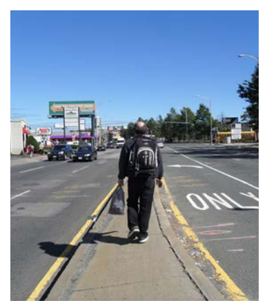
Multiple lanes of traffic on the Lynnway makes for a risky crossing by pedestrians.

The study recommended several short-term measures to improve safety, access to the waterfront, and traffic