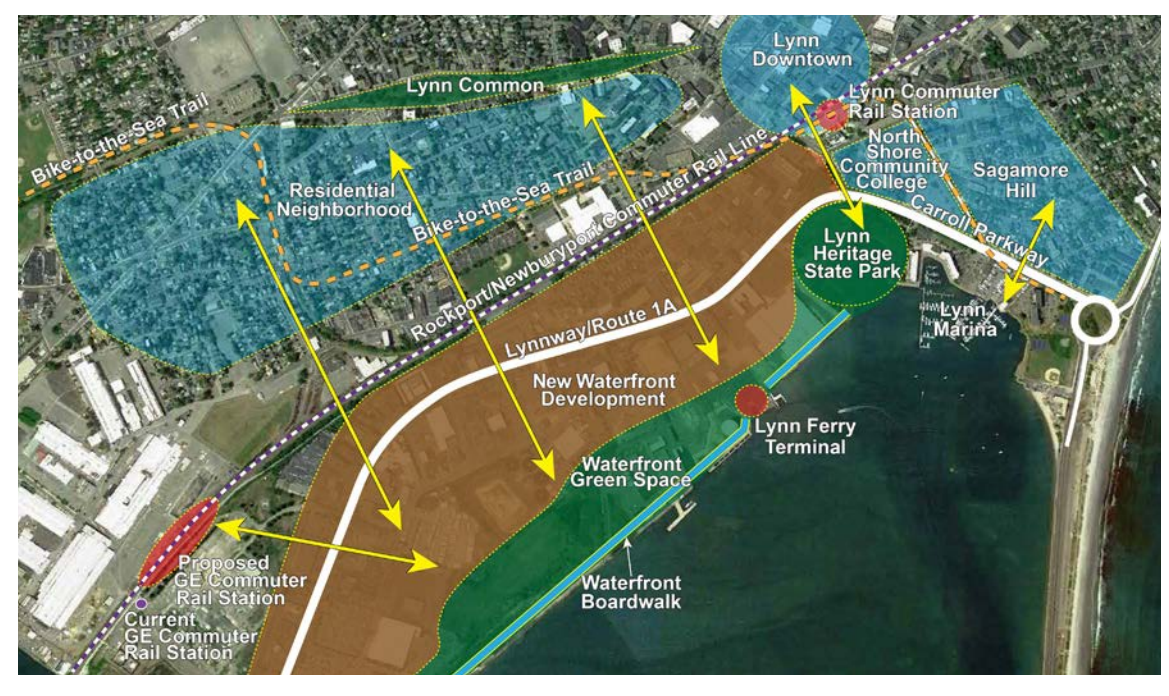
The study area of the Route 1A/Lynnway/Carroll Parkway Study.

Read the Route 1A/Lynnway/ Carroll Parkway Study on the MPO's website (http://www.bostonmpo.org/2015_priority_corridors.)