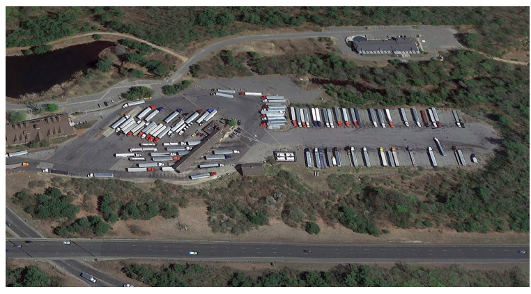
A large truck stop in Sturbridge, Massachusetts, next to I-84

A preferable rest location is a large commercial truck stop, where diesel fuel, maintenance services, food, and other amenities are available. Some are equipped with truck stop electrification (TSE) technology that provides electric current to power refrigeration units, heating, and air conditioning while the tractors' diesel engines are turned off. Public rest areas on interstates can