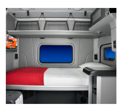
Sleeper cab interior

Semi-trailers used for long-distance routes are often pulled by a tractor with an integrated sleeping compartment. These "sleeper" units provide the driver a convenient and comfortable place to rest. The challenge for a driver, however, is to find a rest location when nearing the end of the allowed driving period that is safe, legal, and conveniently located for the next day's