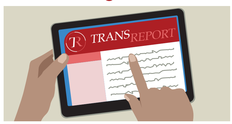
Access MPO news on your mobile device, tablet, or computer.